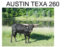
AUSTIN TEXA 260