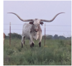
WS SUN STAR