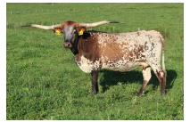
ANGEL FROM ABOVE 1314