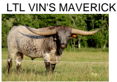
LTL VIN'S MAVERICK