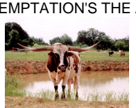
TEMPTATION'S THE ACE