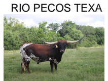
RIO PECOS TEXA