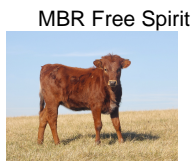
MBR Free Spirit